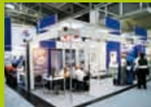
Row (1 side open) EUR 3,840/unit

Package price includes: • Stand setup and dismantling • 12 m 2 stand space (4 x 3 m) • carpeting in light gray • Grid ceiling design with 4 lights (80 Watts) • Name sign with up to 15 letters (Helvetica) • 1 lockable closet • 1 table cabinet (100 x 100 x 50 cm) • 1 table (70 x 70 cm) with 4 upholstered chairs • 1 brochure holder • Electrical connection including 1 outlet and electricity