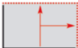
Corner stand (2 sides open)