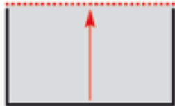
Row stands (1 side open)

You design, plan and build your own stand. The price per square meter is as follows: