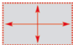
Island stand (4 sides open)