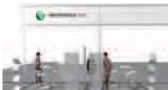
Wireless / World of MEMS