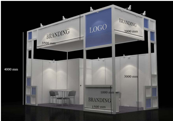
Design – 3: EUR 110/m 2