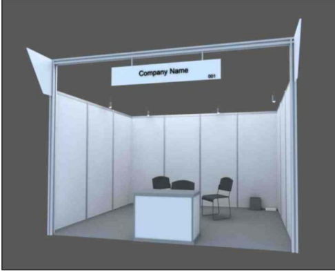
Design – 1: EUR 50/m 2