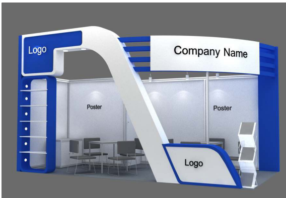
Design – 4: EUR 180/m 2

Printing of company logo and branding is included in the package. Printing of graphics for wall panels is not included but can be ordered at an additional charge.