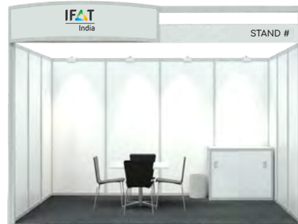
Design - 2: € 60/ SQM

Booth power included and printing of graphics for wall panels and . counter table is not included but can be ordered at an additional charge.