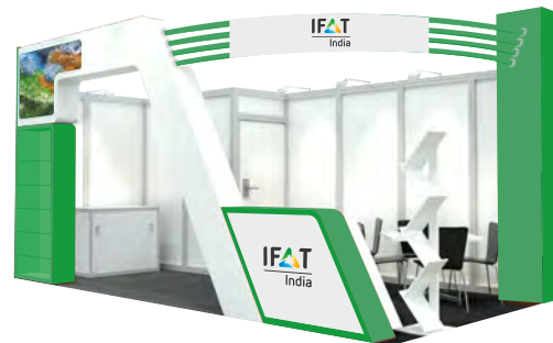
Design - 4: € 180/ SQM

Booth power included and the design may vary if the stand size or number of sides open differ. Printing of company logo and branding is included in the package. Printing of graphics for wall panels is not included but can be ordered at an additional charge.