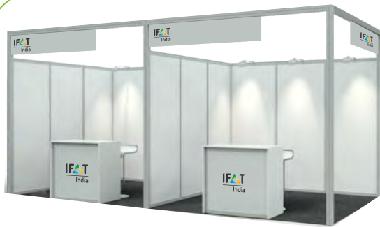
Design - 1: € 50/ SQM

Booth power included and printing of graphics for wall panels and . counter table is not included but can be ordered at an additional charge.