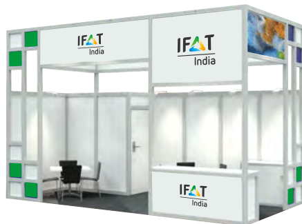
Design - 3: € 110/ SQM

Booth power included and printing of graphics for wall panels and . counter table is not included but can be ordered at an additional charge.